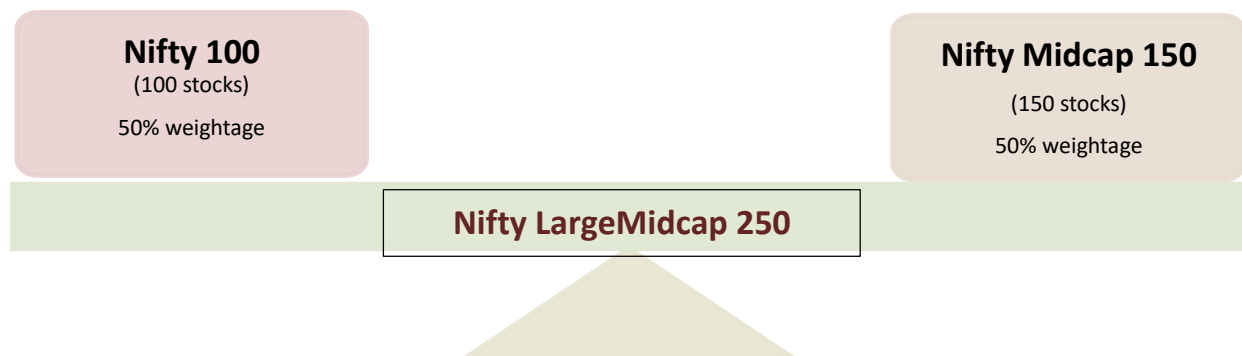
Exhibit 1: Nifty LargeMidcap 250 index - a balanced combination of large and midcap stocks

Of the top 250 stocks, based on full Market Capitalisation, large cap stocks (top 100) typically claim ~83% of total market capitalization and midcap stocks claim the remaining ~17% as on October 31, 2019. The Index provides equal weight allocation to largecap and midcap stocks. By giving equal weight, the index seeks to balance between growth (mid-cap) and stability (large-cap) which cannot be achieved if weighed on the basis of market capitalization due to skewness towards largecap.